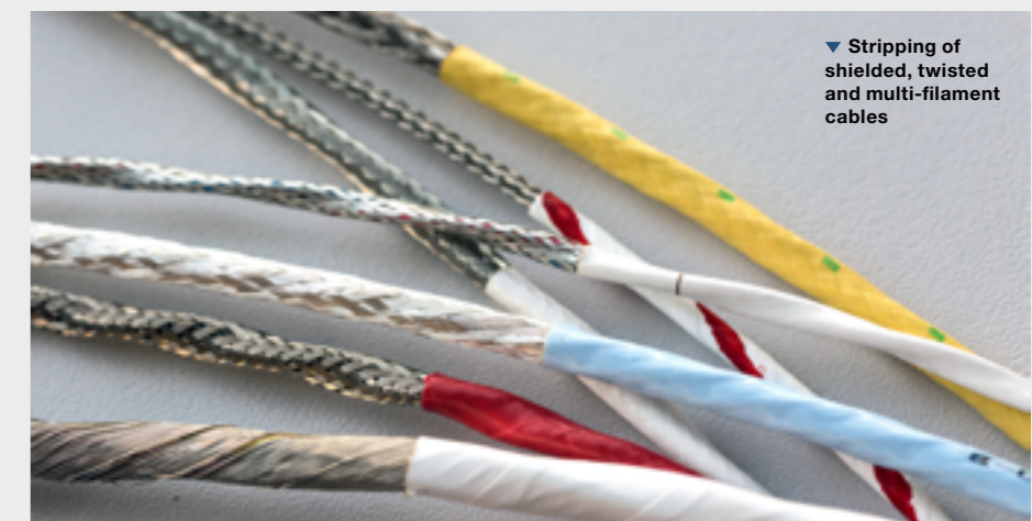
▼ Stripping of shielded, twisted and multi-filament cables